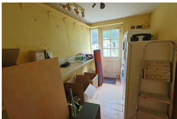
Utility Room 9'0 x 6'1 (2.74m x 1.85m)