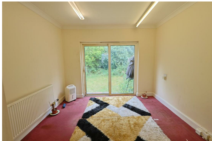
Reception 11'0 x 9'0 (3.35m x 2.74m)