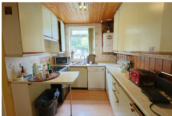
Kitchen 9'0 x 7'10 (2.74m x 2.39m)