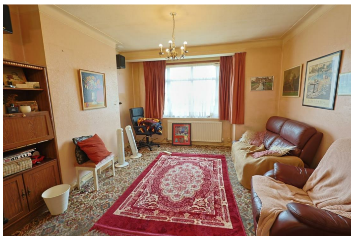
Living Room 26 x 12'10 (7.92m x 3.91m)