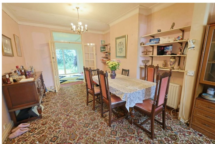
Living Room 26'0 x 12'10 (7.92m x 3.91m)